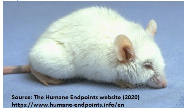
Image 2. Score 3 (severe) for the criteria: "coat condition". This mouse has diffuse piloerection, image source: <u>https://www.humane-endpoints.info/en</u>